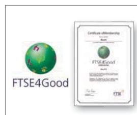
FTSE4Good Index Series