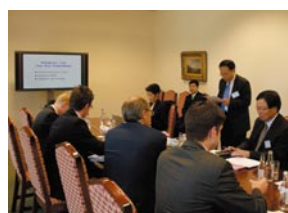
Briefing for overseas investors (6.8.2007)