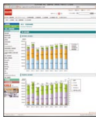
IR activities on the Web

In order to provide all individual investors with easy-to-understand information in a timely manner, ROHM established an investor's corner on its website where a wide variety of information relevant to investors is posted. This information includes not only legally mandated disclosure documents such as financial results and financial statements, but also annual reports, results briefing materials, shifts in financial indicators, and shifts in financial data.